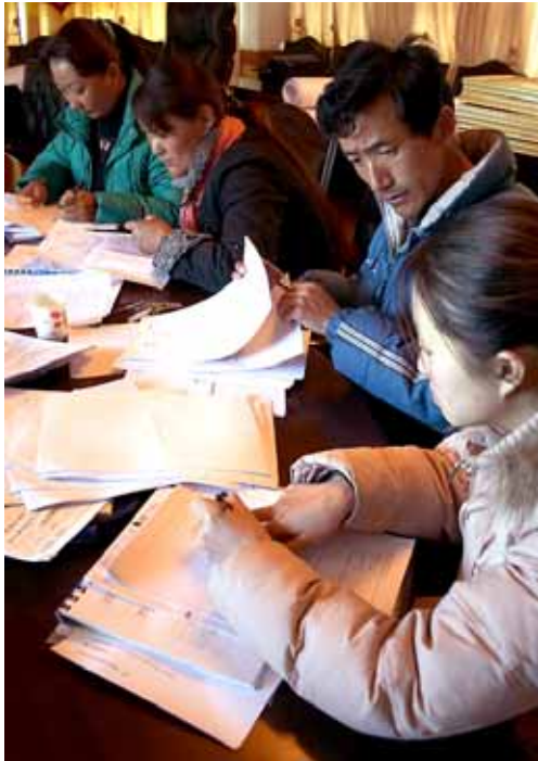
Workshop participants work together to analyse information collected via in-depth interviews and focus group discussions.