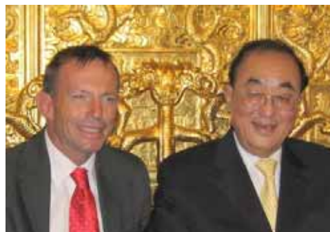
Australian Health Minister, Tony Abbott, and then Chinese Health Minister, Gao Qiang

Australia's Health Minister, Tony Abbott, visited China in April to sign a new 3 year action plan to cooperate on key health issues. The new AusAID Integrated Health and HIV/AIDS Facility, due to commence in July, will support this action plan by providing assistance for HIV/AIDS, other emerging infectious diseases and health system strengthening. The Facility will run for 5 years with an Australian contribution of A$25 million.