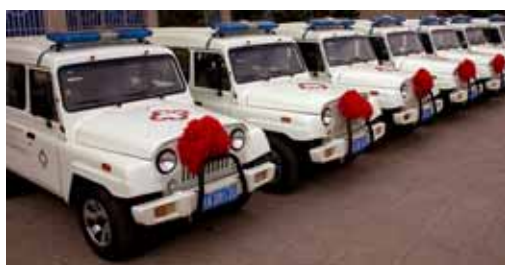
Ambulances 'decorated' for the hand over ceremony held on 21 March in Lhasa.

Families in Damxung, Nimu, Linzhou and Qushui counties of Lhasa Municipality now have better access to emergency medical care since the Tibet Health Services Support Program (THSSP) provided 14 township clinics with ambulances in March.